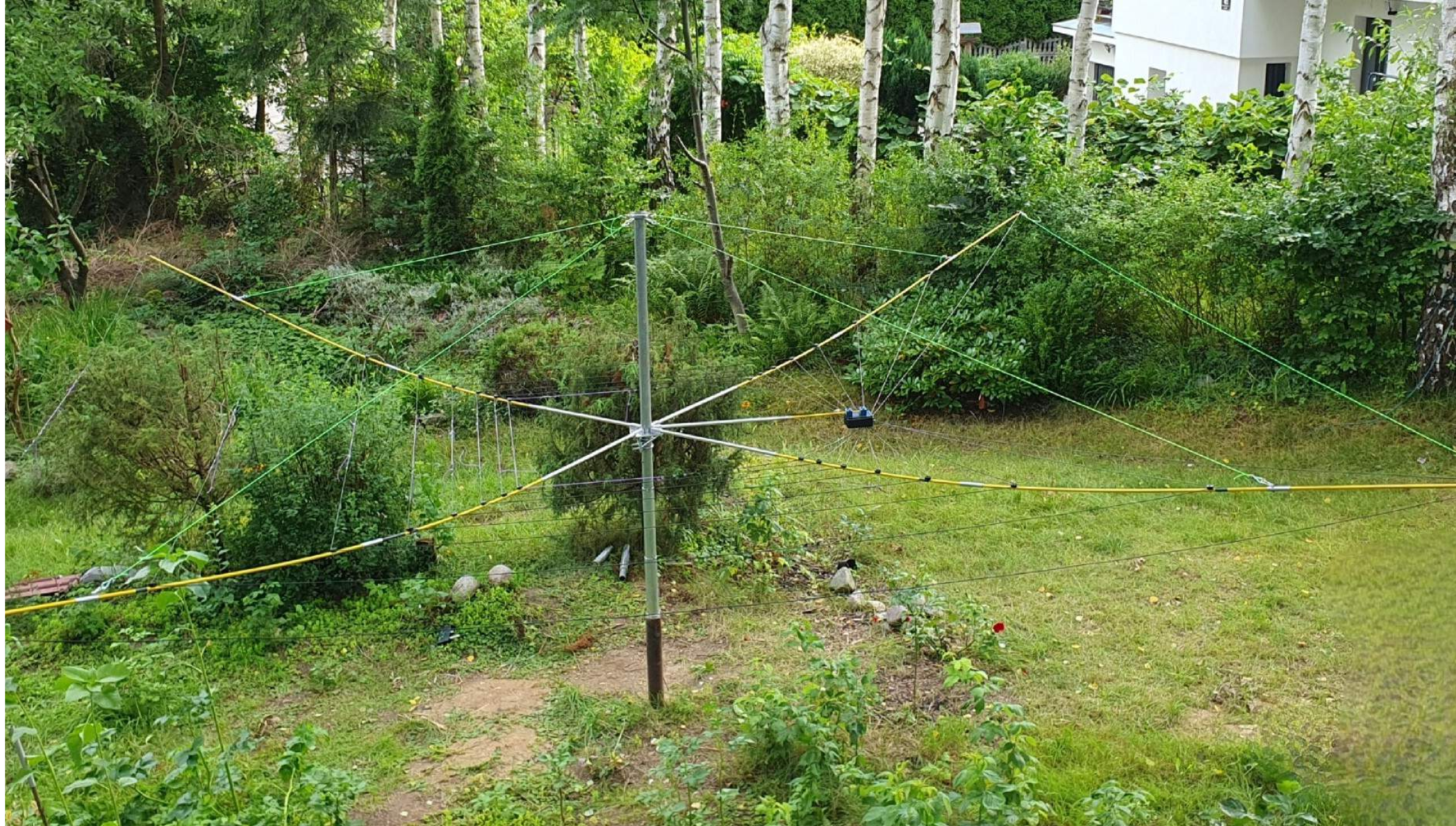
General view of the antenna after mounting on the mast.,